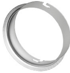
FSB-EA Elinchrom Adapter