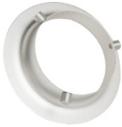
FSB-BA Bowens Adapter

Speedring Adapters for use with flash units having Bowens, Elinchrom, and Profoto mounts