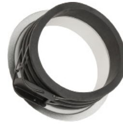
FSB-PA Profoto Adapter