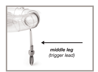
ensure that all legs are straight