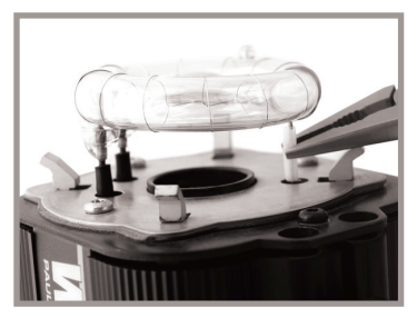
use pliers, if needed, to straighten legs