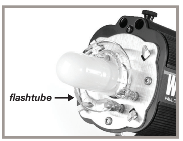
White Lightning ™ X-Series faceplate